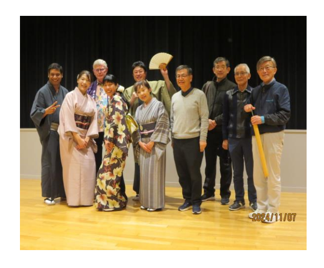
Commemorative photo with everyone