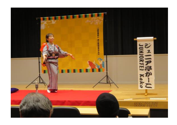
Vaudeville dance (Kako-san)

In addition, we received following very positive feedback in the post-event questionnaire.