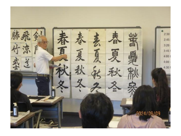
Greetings from the organizer